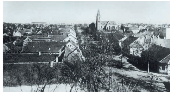
The main street in Franztal around 1942

1932 The third school in Franztal is being built. Semlin is annexed as a district of Belgrade. Franztal can maintain the characteristics of an old austrian settlement. At the time of the flight in 1944 Franztal embraced an area ten times that at its founding and has about 7000 inhabitants. But Germans also live in townships I and II of Semlin.