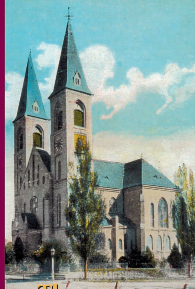
The Church of St. Wendelin