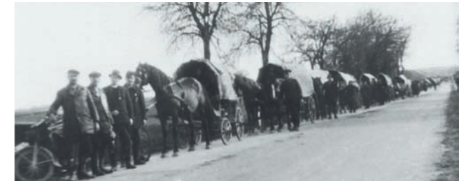
From October 5 through November 5, the Franztaler wagon trek covered more than 1000 km to Mondsee.

1944 November 5: a part of the Franztalers arrive in a large wagon trek (167 wagons) in Mondsee after a 4-week, 1000 km journey. They are housed in camps, in farms and in private homes throughout the rural Mondsee communities. Many emigrated during the following years, and thus Franztalers live on three continents in 17 states. But many also found a new home in Austria and Germany.